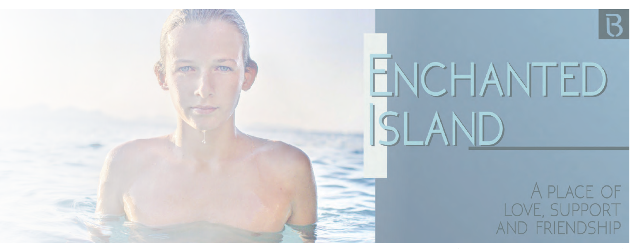
Unpublished banner for the reopening of Enchanted Island.